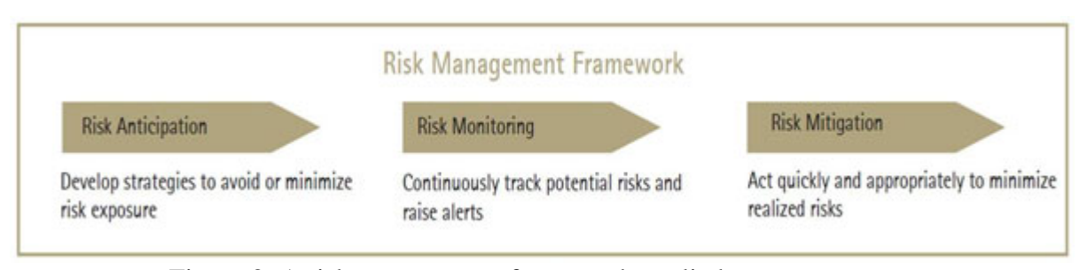
Figure 3: A risk management framework applied to procurement.

At the Anticipation stage, for example, leaders align risk programs with category strategies, make use of risk-sharing clauses, excel at predictive analytics and apply value engineering concepts to look at alternative materials. At the Monitoring stage, they work closely with select suppliers, design formal supplier relationship management programs, make maximum use of external data sources, and identify and assess the level of risk at key stages of the strategic sourcing process. For Mitigation, leaders stand out in the formation of decision processes (e.g., who makes and follows through on a mitigation decision) and the use of formal metrics and measurements.