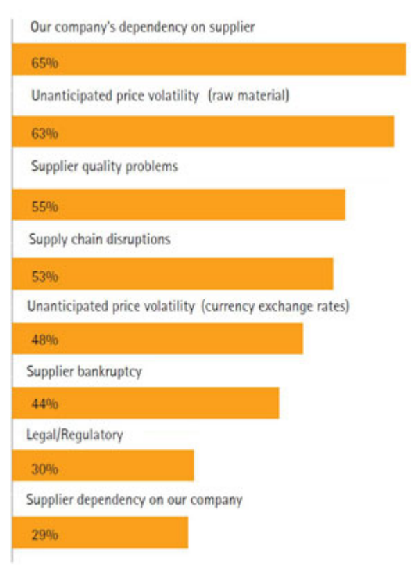
Figure 1: One hundred and twenty seven chief procurement officers were asked "For each procurement risk, indicate the extent to which your company faces that risk." Depicted is the percentage of respondents who indicated a moderate or high degree of risk.

1). Accenture researchers also learned that almost half of all survey respondents' spend is exposed to volatility in raw materials, and that more than a quarter of all respondents are exposed regularly to currency volatility.